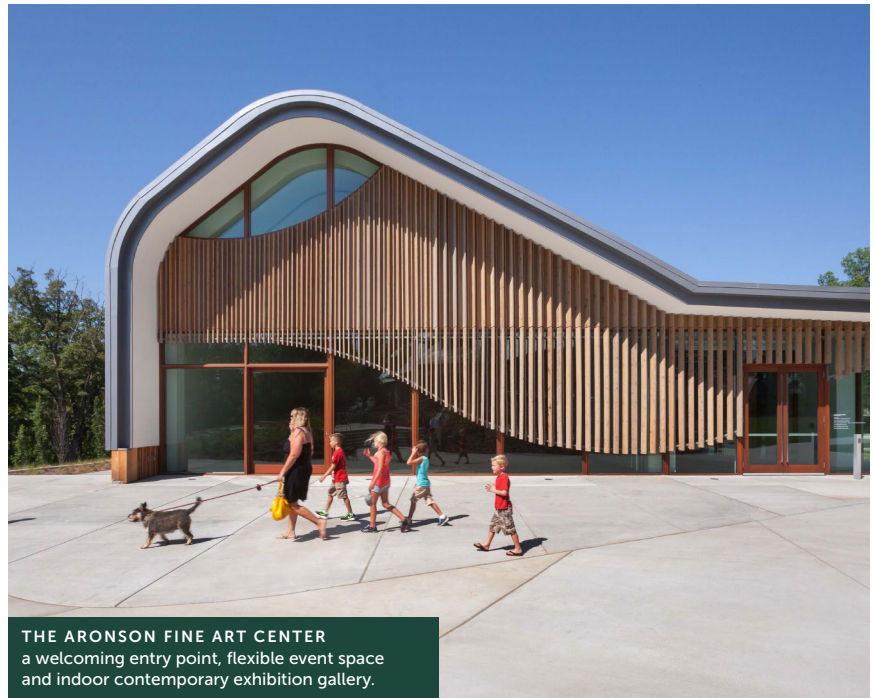
THE ARONSON FINE ART CENTER a welcoming entry point, flexible event space and indoor contemporary exhibition gallery.

Laumeier is seeking a leader who will honor a rich history and visibly define Laumeier's future.